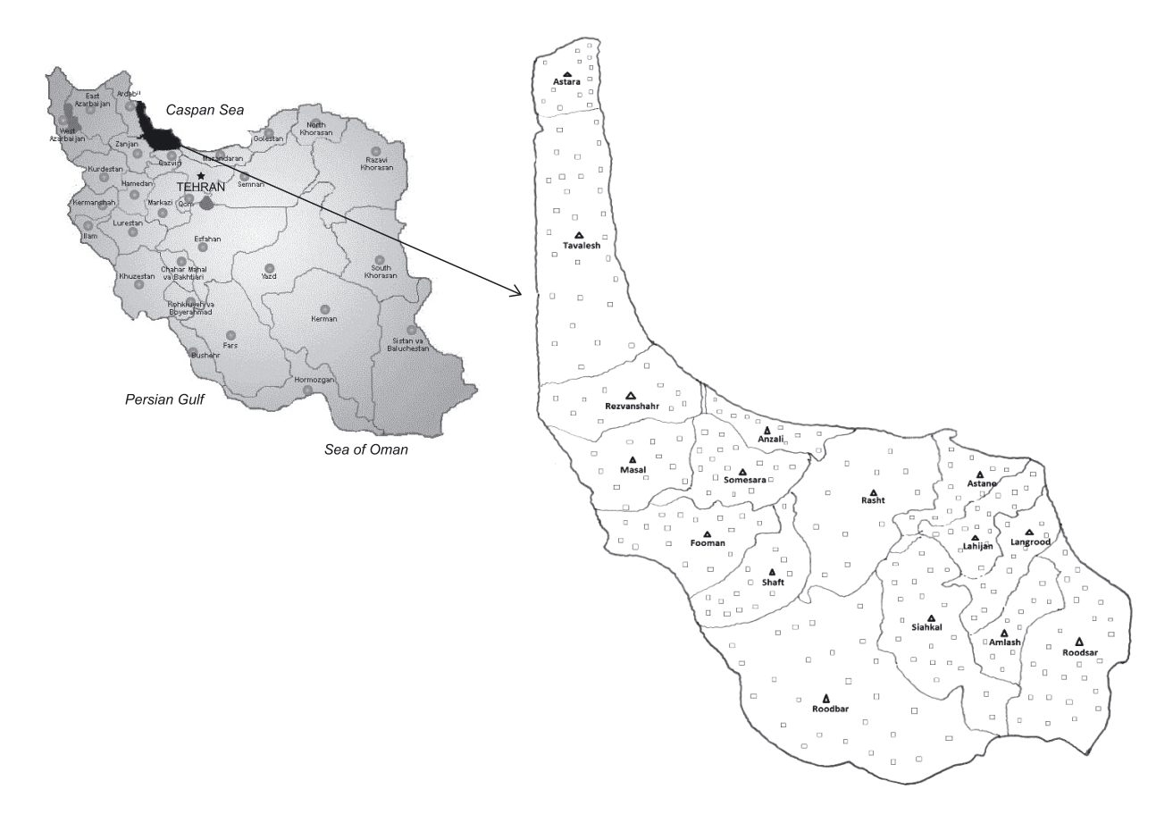
Fig. 1. Distribution map of the samples taken from rice fields in different areas of Guilan province (with the capital city, Rasht), northern Iran. Sample locations are shown with white squares; triangles indicate location of majorcounties for this study

For the fresh seed samples survey, 255 fresh seed samples from 16 locations were collected. The number of seed samples for each location is shown in Table 1. Nematodes were extracted from 50 g of fresh seeds (out of 500 g), randomly collected from each point, then they were extracted using the Coolen and D'Herde technique (1972). The extracted nematodes were counted and fixed. Species characterization in this survey was based on morphological and morphometric characters using available literature and their original descriptions (Hopper and Cairns 1959; Loof and Luc 1990; Nickle and Hooper 1991; Jairajpuri and Ahmad 1992; Hunt 1993; Handoo 2000; Siddiqi 2000; Andrássy 2009; Ahmad and Jairajpuri 2010).